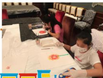
Watercolor Sketching 花藝水彩寫生