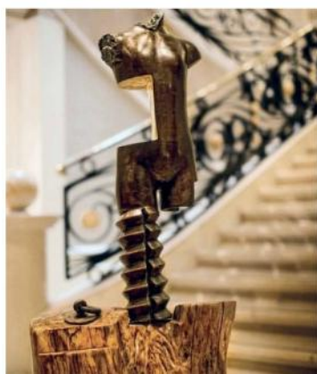
L'Ephebe Endormie By Remus Botar Botarro Club Bel-Air Peak Wing 貝沙灣朗峰會所