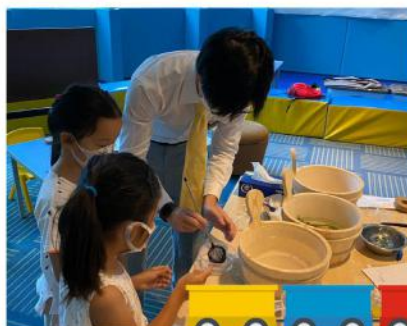
DIY Terrarium 手工生態瓶