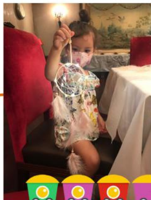
DIY Dreamcatcher 星空捕夢網掛飾