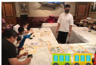
Ink Wash Qute Painting Q版水墨畫

留在家中很悶？不見得！今年夏天，貝沙灣會所舉辦了多項暑期活動，孩子們踴躍參加，既歡樂又有新鮮的體驗呢。