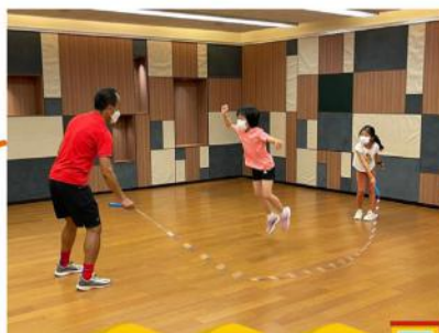
Rope Skipping 花式跳繩