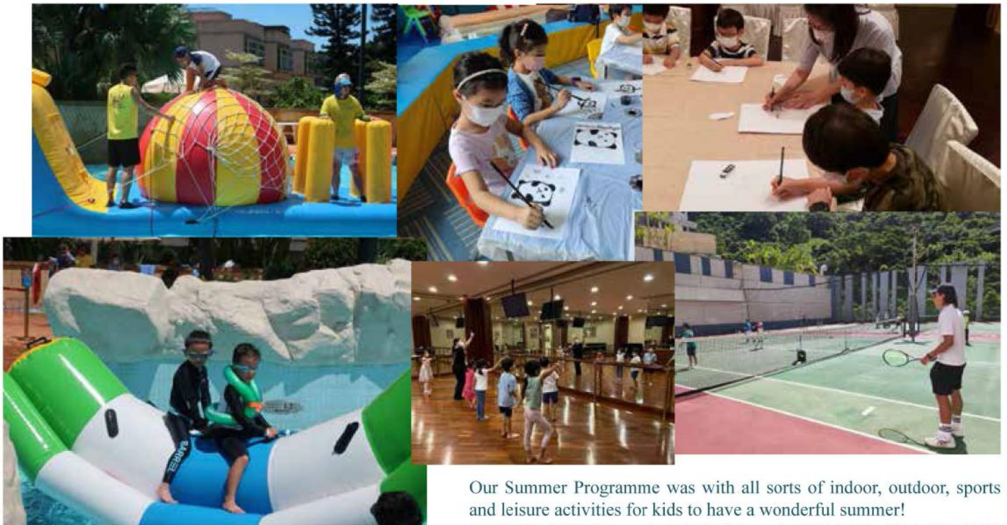
Summer Water Fun Day 夏日水上嘉年華 2022

Our Summer Programme was with all sorts of indoor, outdoor, sports and leisure activities for kids to have a wonderful summer! 暑期活動包羅萬有，有室內有室外，有動又有靜，讓小朋友過了一個繽紛的夏日！